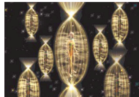
Third Lattice Illustration

As our own Universal Parent we generate infinite love for ourselves which unites us with the energy of the one.