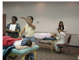
Practitioner Training Class EMF Balancing Technique, Energetic Foundations, Phases I - IV

All Trainings can be scheduled on request