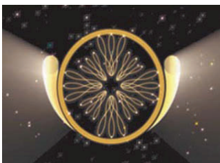
The Core Energy Pattern

This is where we invite ourselves to initiate a new level of universal harmony.